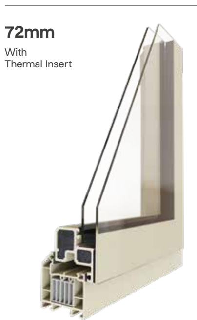
replacement window. Thermal reinforced design, ideal for smaller bathrooms, en-suites or kitchens. Five-chamber nylon thermal insert reduces convection, heat loss and steaming up in moist room environments. 1m maximum span. PVC outer, strong fibreglass inner and frame means steel insert not required.