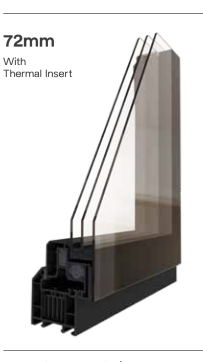
The perfect north-facing, harsh elements bathroom or kitchen window. Triple glazed thermal reinforced design, ideal for bathroom and kitchen windows exposed to north winds and little sunshine. Five-chamber nylon thermal insert reduces convection, heat loss and steaming up in moist room environments. Perfect for new-build, extension and overexposure replacement. PVC outer, aluminium sash.