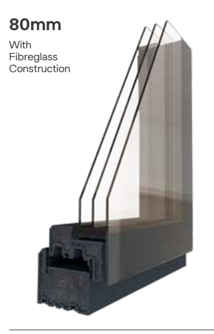
The ultimate window. The ultimate in energy efficiency, strength, security and sound reducing performance. With an all fibreglass construction that's fully insulated inside and out, it's perfect for large new-builds and very large feature windows.