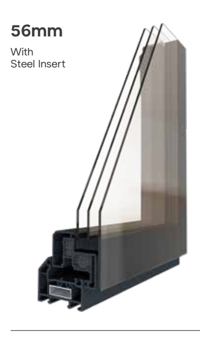
The perfect north-facing, harsh elements large window. Triple glazed steel reinforced slimline design, ideal for larger windows exposed to north winds and little sunshine. Perfect for new-build, extension and overexposure replacement. PVC outer, aluminium sash spanning 1m+.